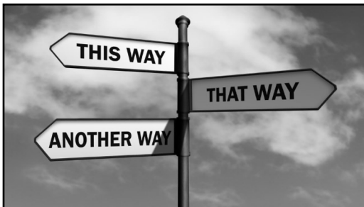
Types of Theology